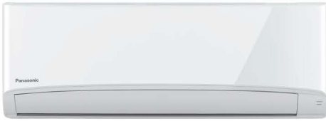
CS-PV9UKH | CS-PV12UKH

WALL-MOUNTED : STANDARD NON-INVERTER R410A Single-Split Type