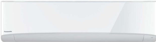
CS-PV18UKH | CS-PV24UKH | CS-PV28UKH